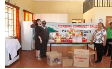
Food donations to the Old Age Homes And Kidshelter

Visit our office at the Greenscheme Plot , no 16 Phone: 062—52 3440 Fax: 062—52 3441 P.O. Box 3498 Rehoboth Email: rehitrust@iway.na