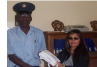
Police: Telephone Donation