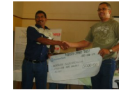
Donation to Rehoboth Farmers Association: N$ 5000.00