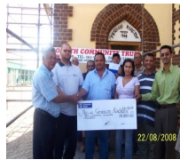
N$ 10 000.00 Donation to the Lutheran Church [Paulus Congregation]