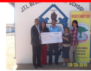
Donation to J.T.L. School N$ 1500.00