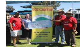
Trust donated N$ 40 000.00 to the Sam-Khubis area upgrading