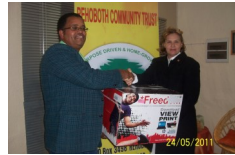
Museum donation: laptop & printer : N$ 6 800.00