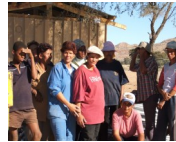
Evergreen fencing: N$ 28,000.00