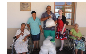
Sugar donation to the local old age homes