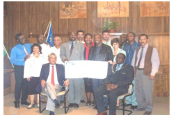
Block F & G Road: N$ 150,000