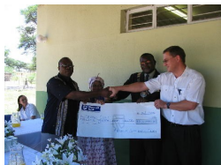
Block E Clinic: N$ 60,000.00