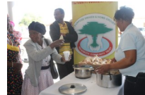
Monthly soup and bread donation to the local elderly