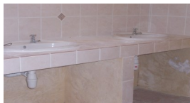
Hermanus Van Wyk: Renovations N$ 65,000