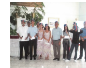
Hope Education Donation: N$ 10,000.00