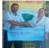
Reho show society: Electric Fencing N$ 40 835.00