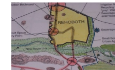
Rehoboth Urban Design Master plan: N$ 40,000.00