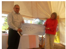
N$ 50 000.00 Donation to the Rehoboth book; Past & Present