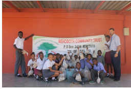
Quarterly fish cake donation to local and surrounding schools 3000 fishcakes per quarter