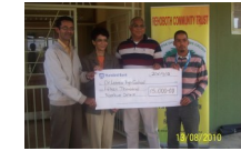
Donation to Dr. Lemmer High School: N$ 15,000.00