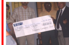
Donation to Ruimte Primary School: N$ 10,000.00